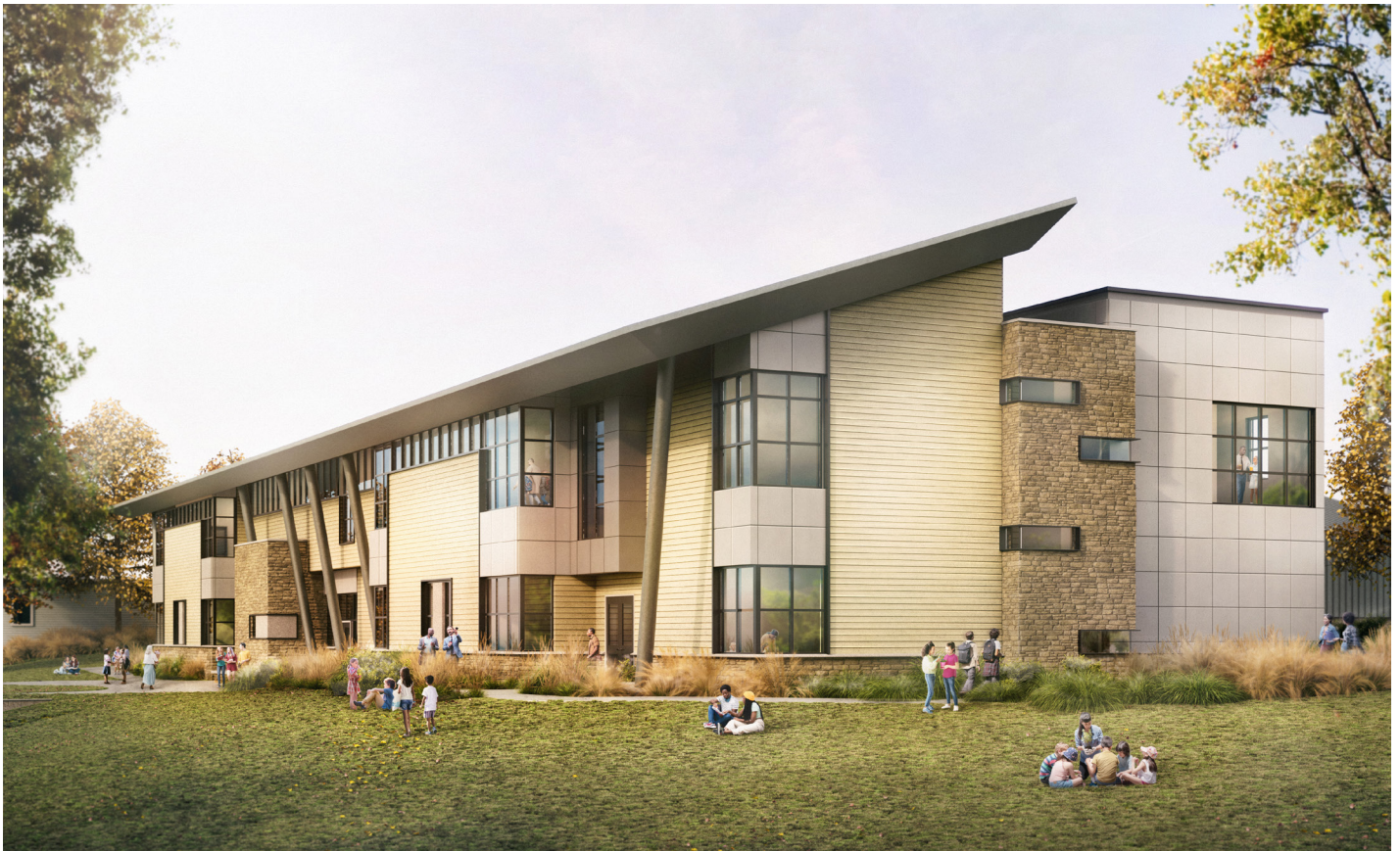
▲ View of the Exterior Northwest corner (top) and southwest corner (bottom)