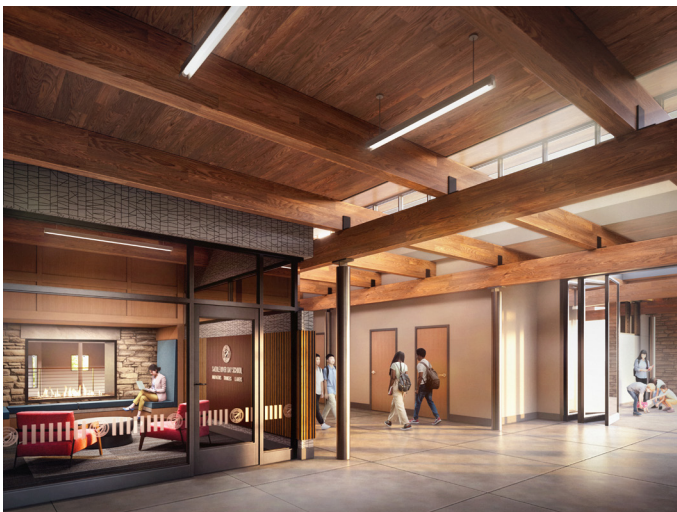
▲ Lobby and Admissions Offices