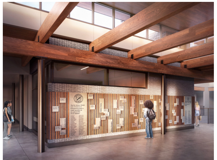
▲ Donors Wall Corridor