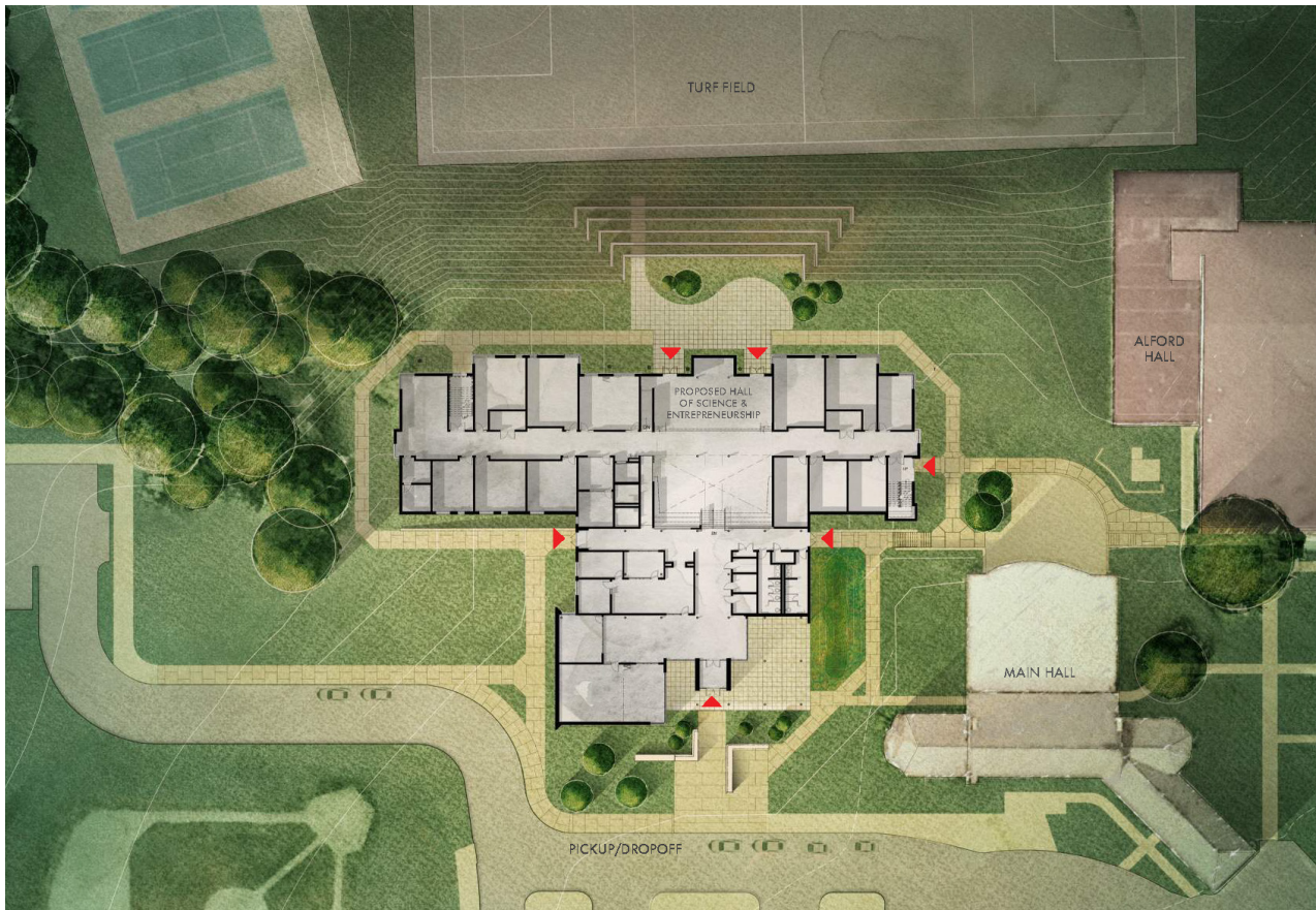
▲ Proposed new academic building site plan