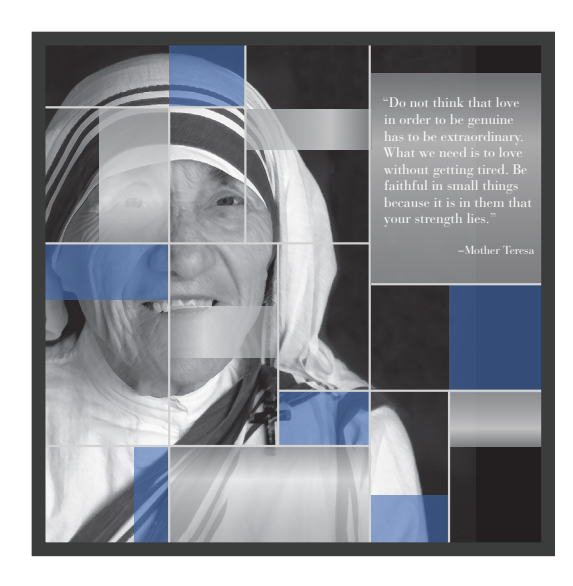
Trinity Hall Wall Graphics Concept Panels