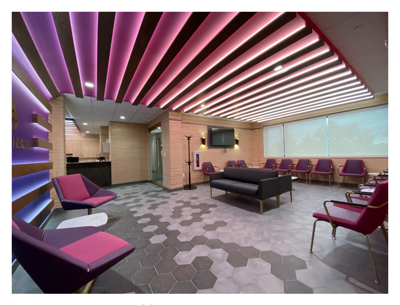
Premium Health New Women's Health Clinic Brooklyn, NY

Premium Health of Brooklyn NY retained DIGroup to design their new Extension Clinic for Women's Health on 16th Avenue in Brooklyn, NY.